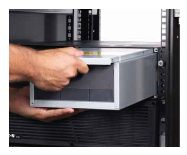
Even non-technical users can easily replace the hot-swappable batteries or power modules without interrupting power to loads

Enables orderly shutdown on non-essential equipment and applications to extend battery runtime for critical loads