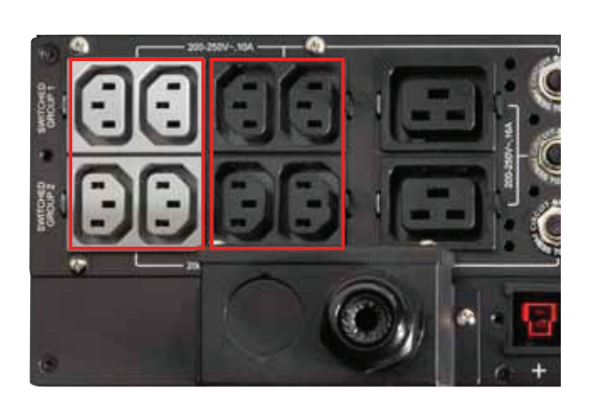
Independently control groups of output receptacles (230V models only)