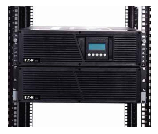
The 9135 (top) fits easily into a rack with an EBM (bottom) and a PPDM (not pictured)